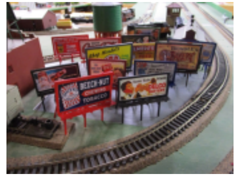
ABOVE: Billboards created using the clinic's methods.

The 7th Division executive hopes that you recognize the increase in value to your membership through this program of free clinics. We also encourage you to let us know of other topics/clinics that you would be interested in learning about; simply drop an email to any of the board members with your preferences.